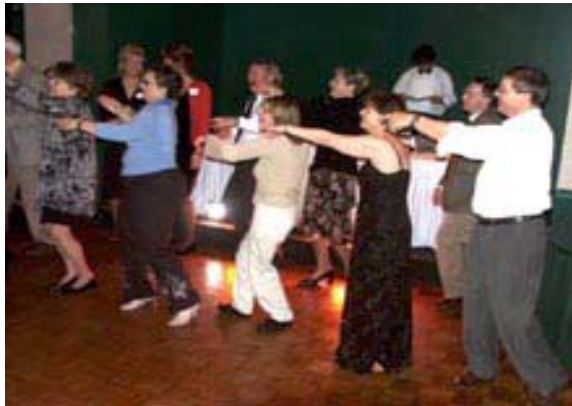
The BYC Rockettes

Boulder, IL - The 26th annual "No Boat Regatta" was held on February 22, 2003 at Orlando Gardens. As has been a BYC custom for many years, it is the time of year that we get together and try to figure out who these people are that we don't recognize with their clothes on! Also, we use the occasion to honor our racers, show appreciation of the acts of volunteerism that BYC is so noted for, and to install our Officers for 2003.